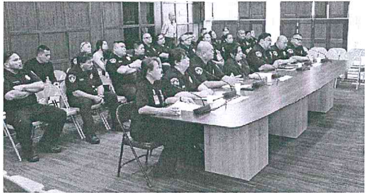
PARITY: Staff members of the Department of Youth Affairs came out in force and gave testimony in favor of Bills 243-35 and 244-35, during a public hearing Tuesday at the Guam Legislature in Hagåtña.

tor were noticeably absent from the public hearing.