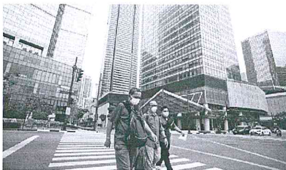
STILL MOVING IN BGC: Pedestrians wearing mask while crossing the road in Bonifacio Global City in Taguig, the Philippines, on Jan. 13.

agency's chief Renato Solidum said. Lava fountains generated 800-meter dark gray, steam-laden plumes and 49 volcanic earthquakes were recorded early Tuesday, according to the agency. Taal Volcano is a tourist attraction and is among the nation's most active volcanoes.