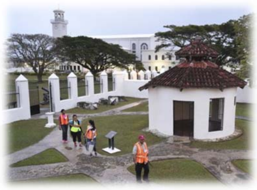
Guam Point-In-Time Count volunteers, Hagatña, Jan. 2017