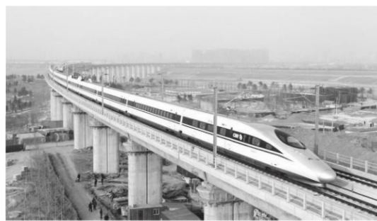
A high-speed train travelling to Guangzhou is seen running on Yongdinghe Bridge in Beijing on Dec. 26, 2012.

Still, the third-quarter figure beat expectations by many economists of about 7.2 percent, or lower, which could have increased calls for a new round of major stimulus measures.