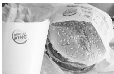
This June 20, 2012 photo shows a burger and fries at a Burger King in Richardson, Texas. Burger King reports quarterly financial results on Tuesday, Nov. 4.

Burger King had announced in August it would bring back Chicken Fries for a limited time after "ongoing guest outcries reached a point where they could no longer be ignored."