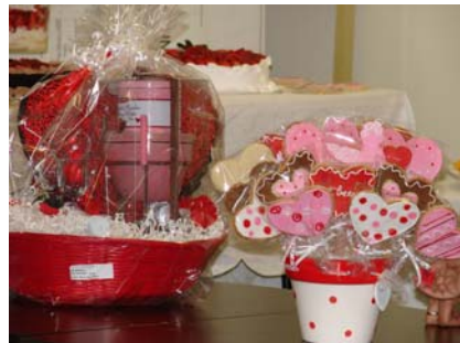
Valentine Basket + Cookie Tree