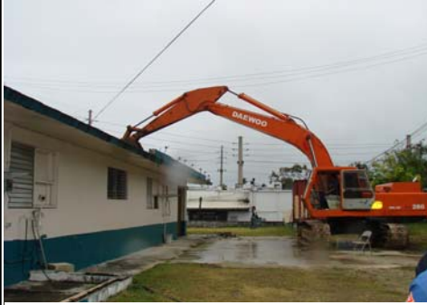
Decommissioning of Barrigada Fire Station

CPD Programs - Community Development Block Grant (CDBG): Facilities To construct new modernized precincts and replace the existing outdated stations Barrigada and Dededo