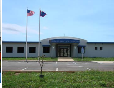
Northern Police Precinct