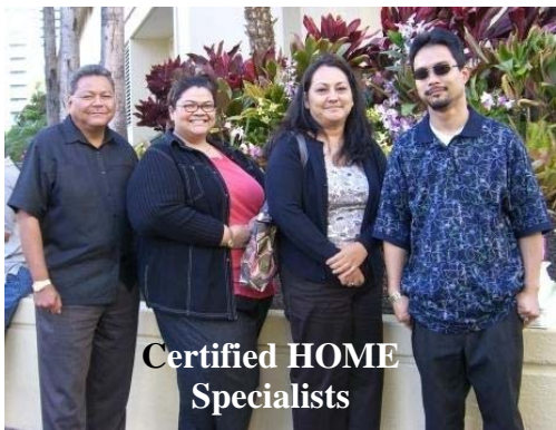
Certified HOME Specialists