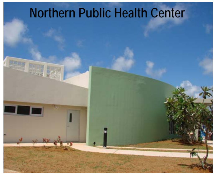
Northern Public Health Center