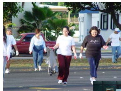
Na' La Bonita Guam