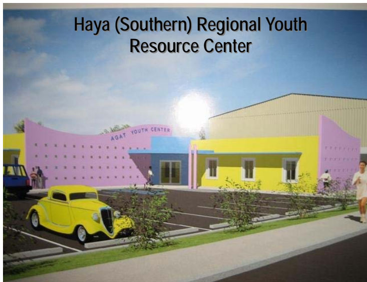
Haya (Southern) Regional Youth Resource Center