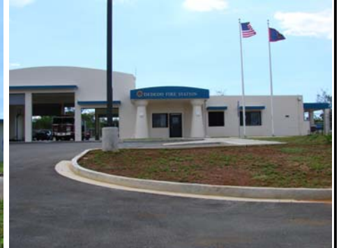
Northern Fire Station

Community Planning and Development Programs - HOME Investment Partnership Program: Construction Caridad I (Mongmong) - 8-unit apartment for homeless adults with disabilities Caridad II (Mangilao) - Group Home to provide supportive services to 9 adults with disabilities